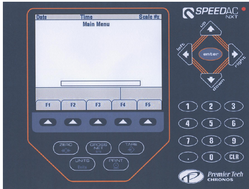
Figure 2 SpeedAC NXT front panel