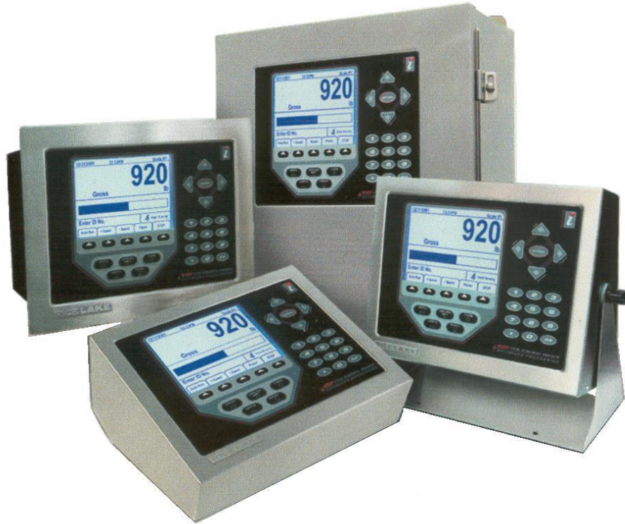
Figure 1 Photograph of controller mount options