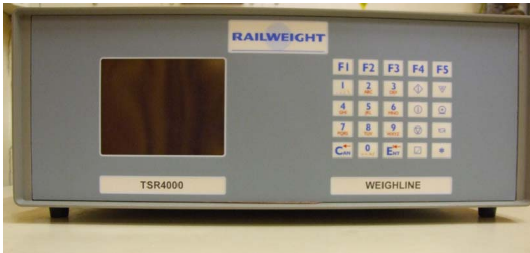
Figure 1 TSR4000 controller