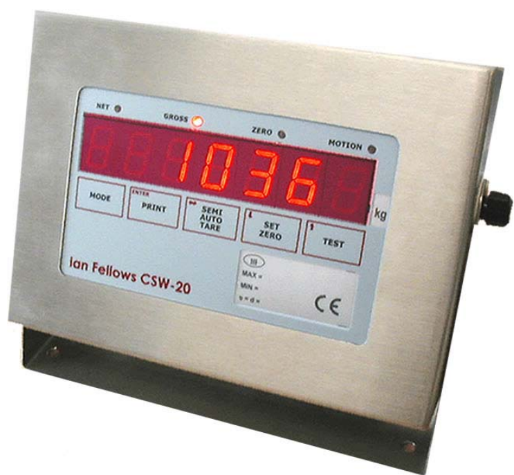
Figure 4 CSW-20 digital weight indicator