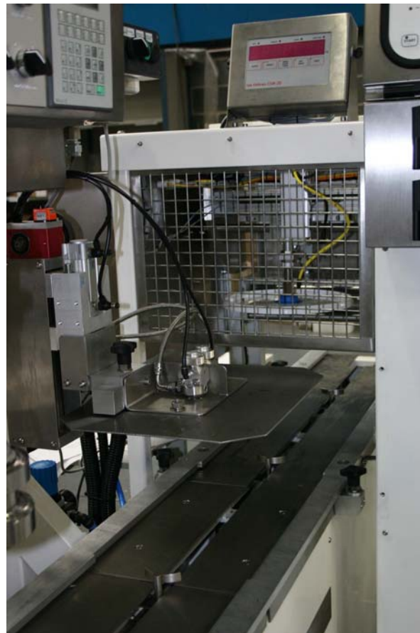
Figure 2 Photograph of the MAC-20