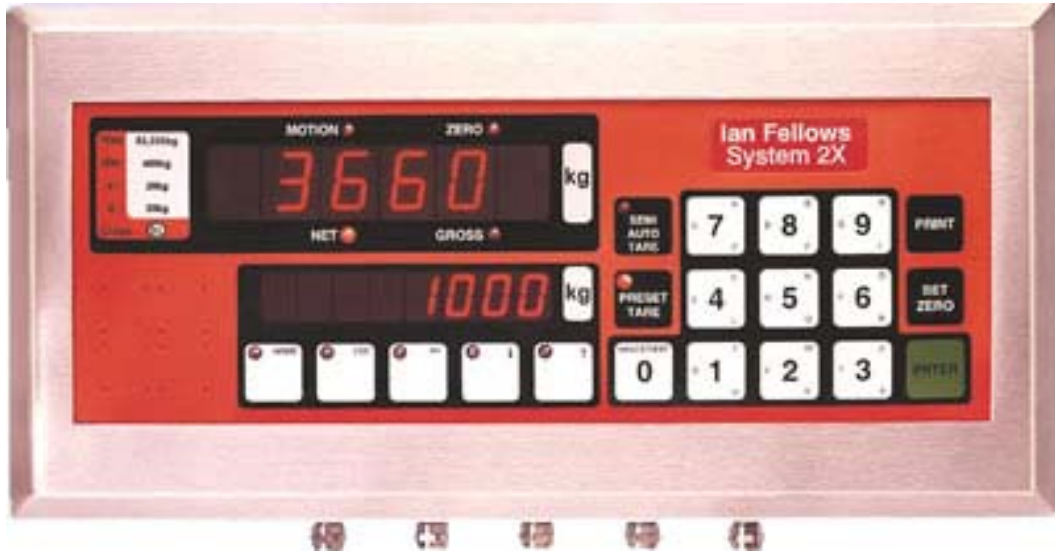
Figure 5 2X digital weight indicator