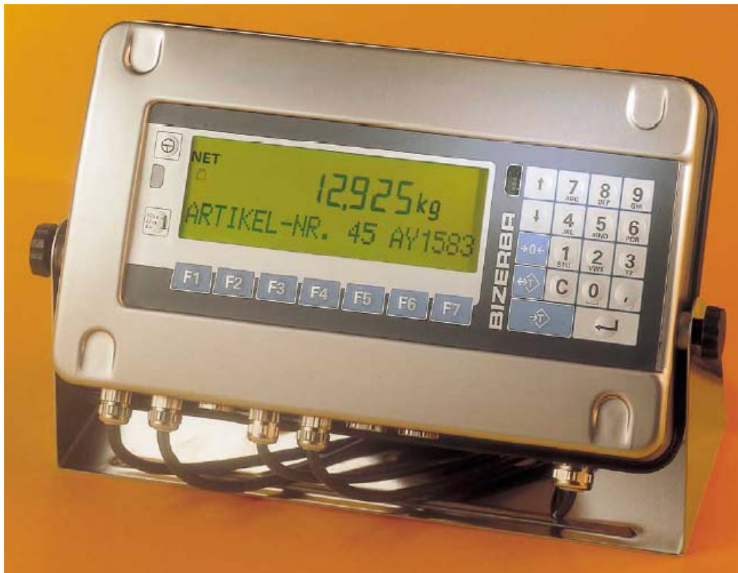
Figure 6 ST-Ex digital weight indicator