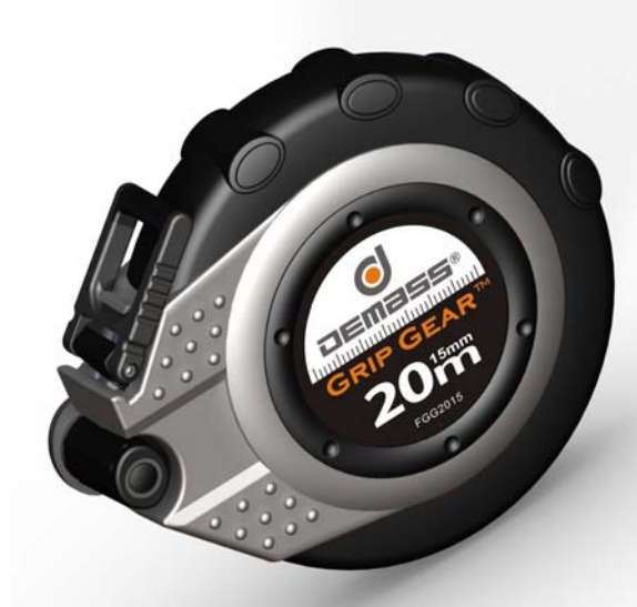
FGG & GG Model series