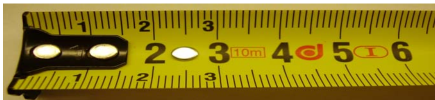
Figure 1 Example of the pattern