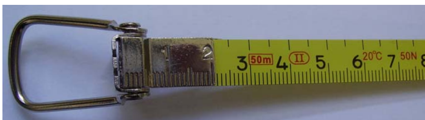
Figure 2 Model GG- Example of long steel tape measure blade