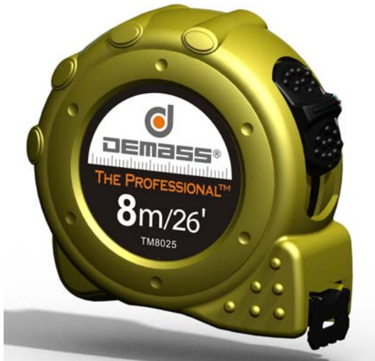
TM Model series