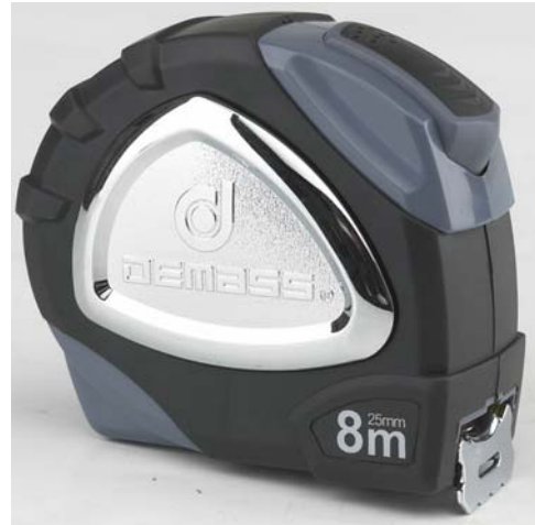
RB Model series