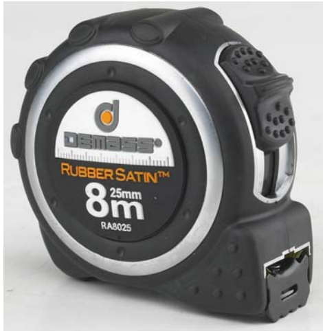
RA Model series