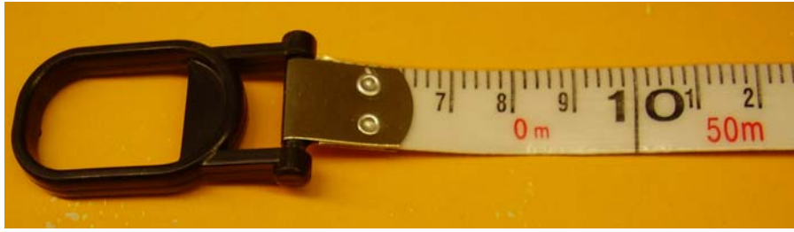
Figure 3 Model FGG- Example of Fibreglass tape measure blade