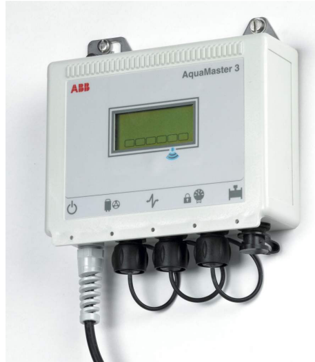
Figure 2 AquaMaster Remote Form