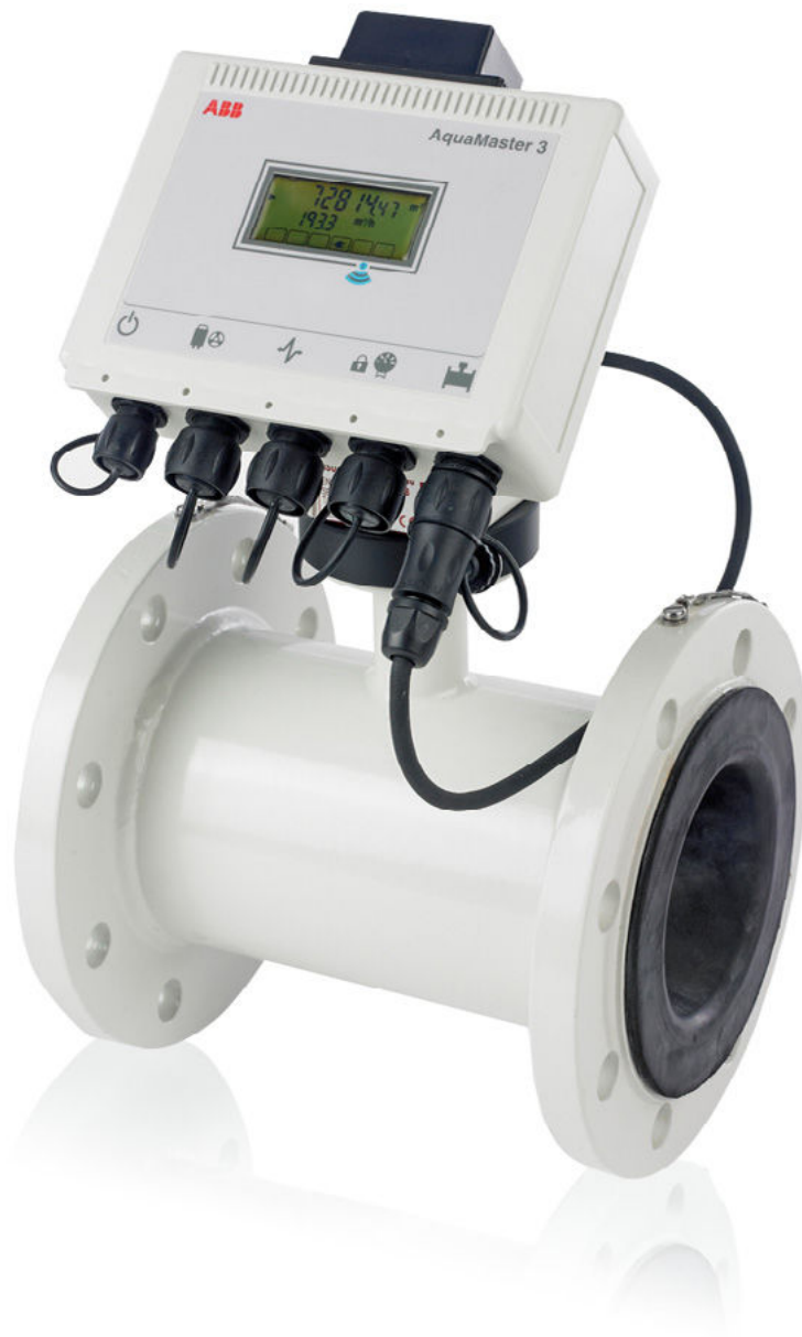
Figure 1 AquaMaster Integral Form