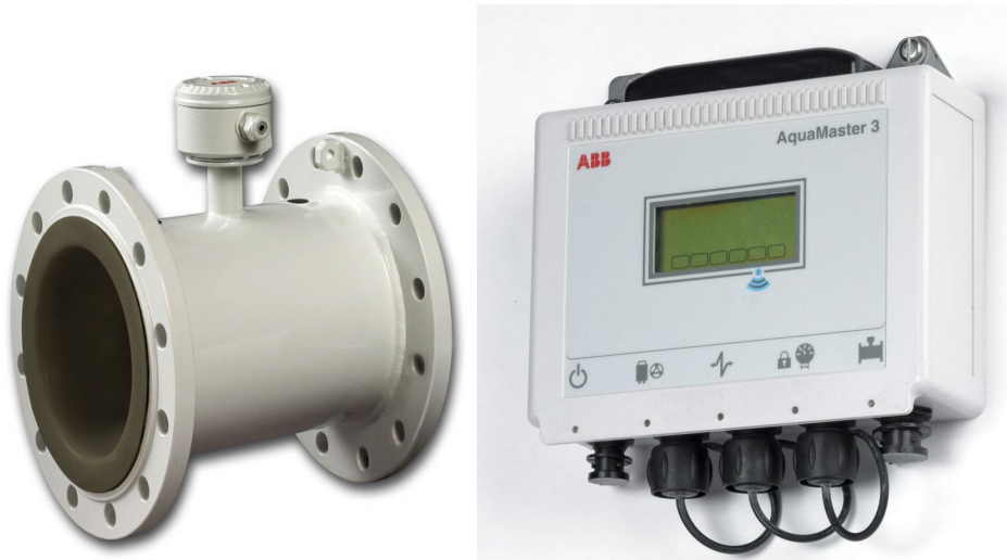
Figure 2 AquaMaster Remote Form