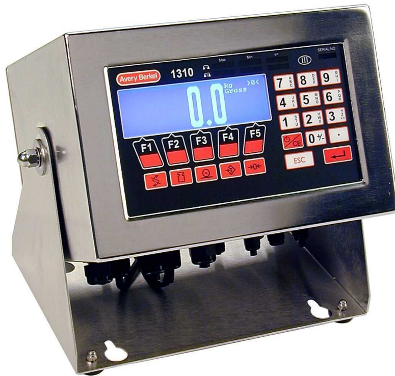
Figure 1 1310 indicator