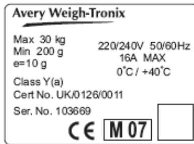
Figure 2 Descriptive label