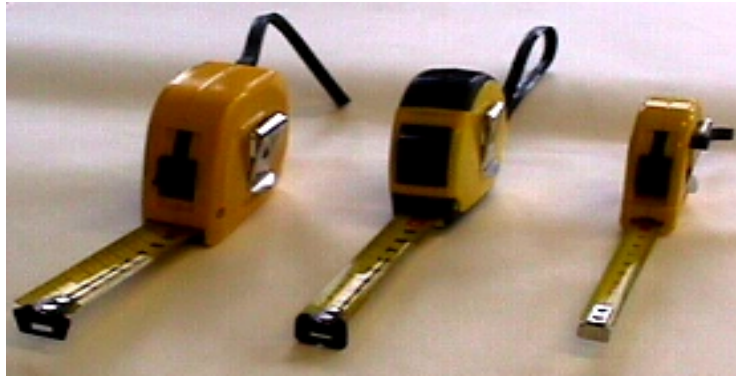
Figure 2 Examples of the case styles