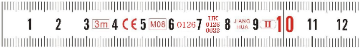
Figure 5 Example of the pattern with markings