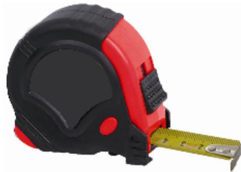
Figure 8 Examples of the case style 87