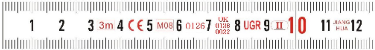
Figure 6 Example of the pattern with alternative markings