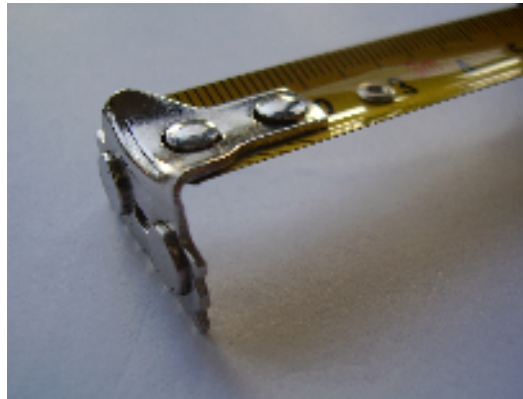
Figure 7 Magnetic hook end