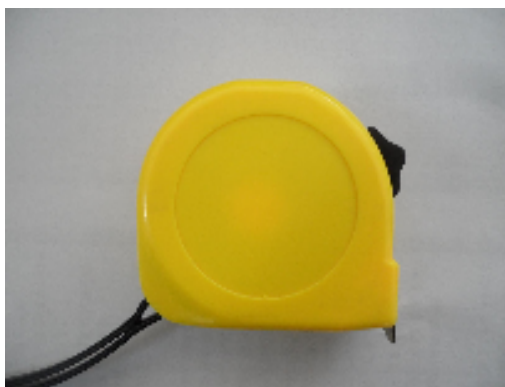
Figure 10 Examples of the case style 19