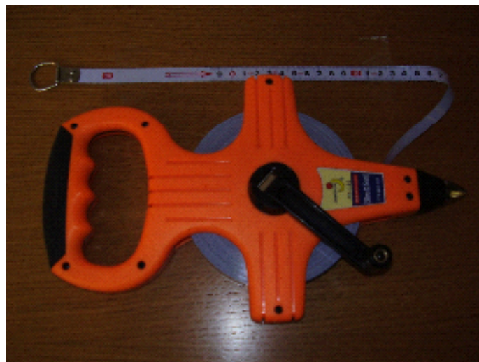
Figure 4 Long measure model with open reel plastic case