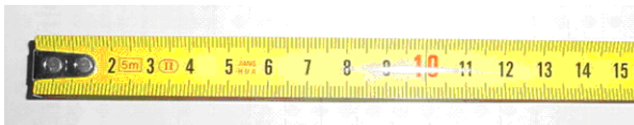
Figure 3 Model JH-