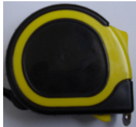
Figure 9 Examples of the case style 82