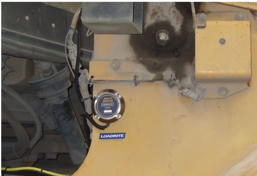
Figure 6 Typical LR966 inclinometer installation