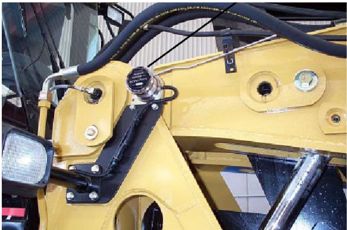
Figure 4 Typical LR908 sensor installation