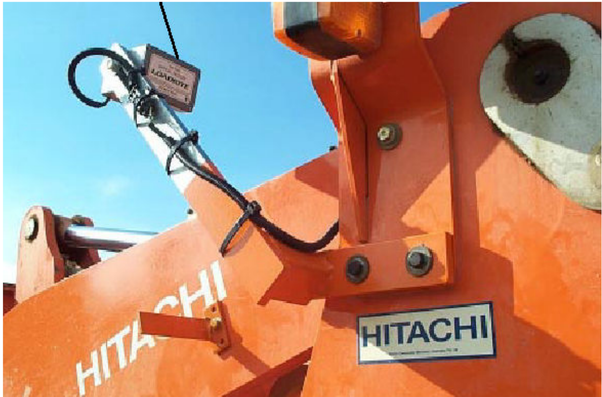
Figure 3 Typical LM960 sensor installation