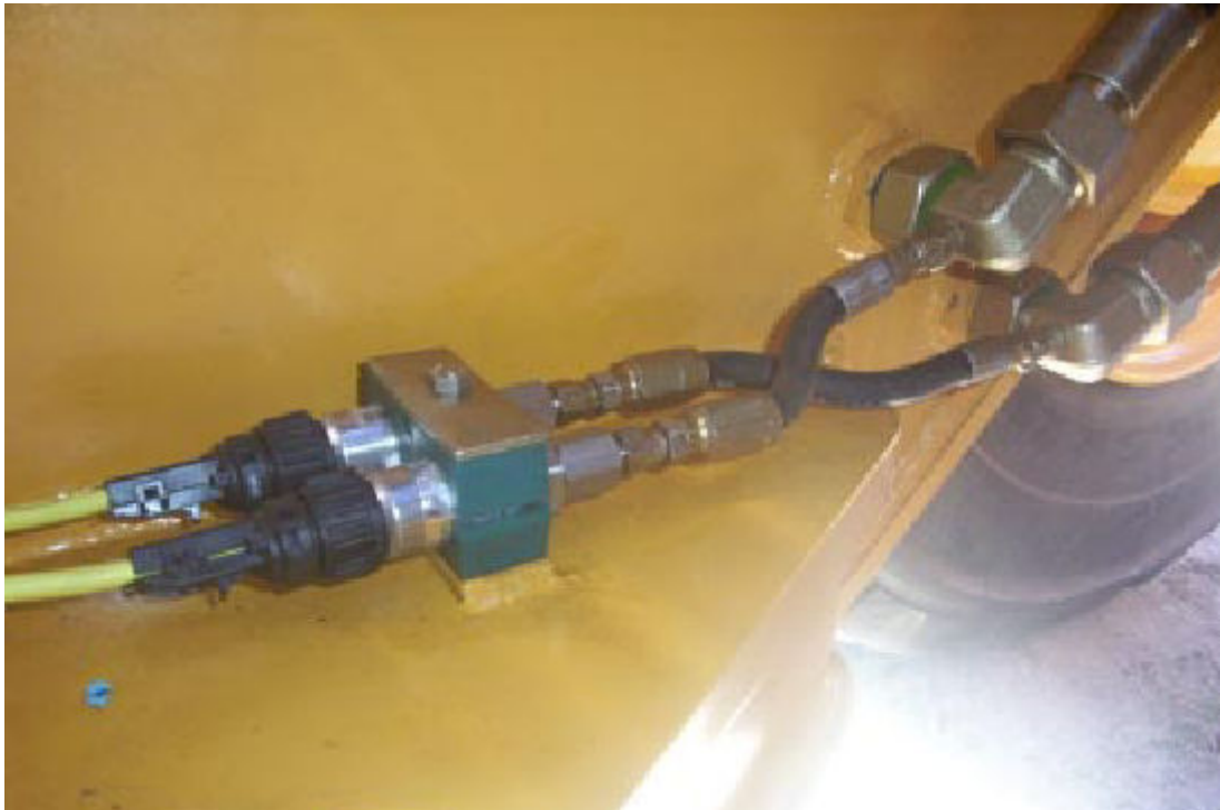
Figure 2 Typical pressure transducers installation