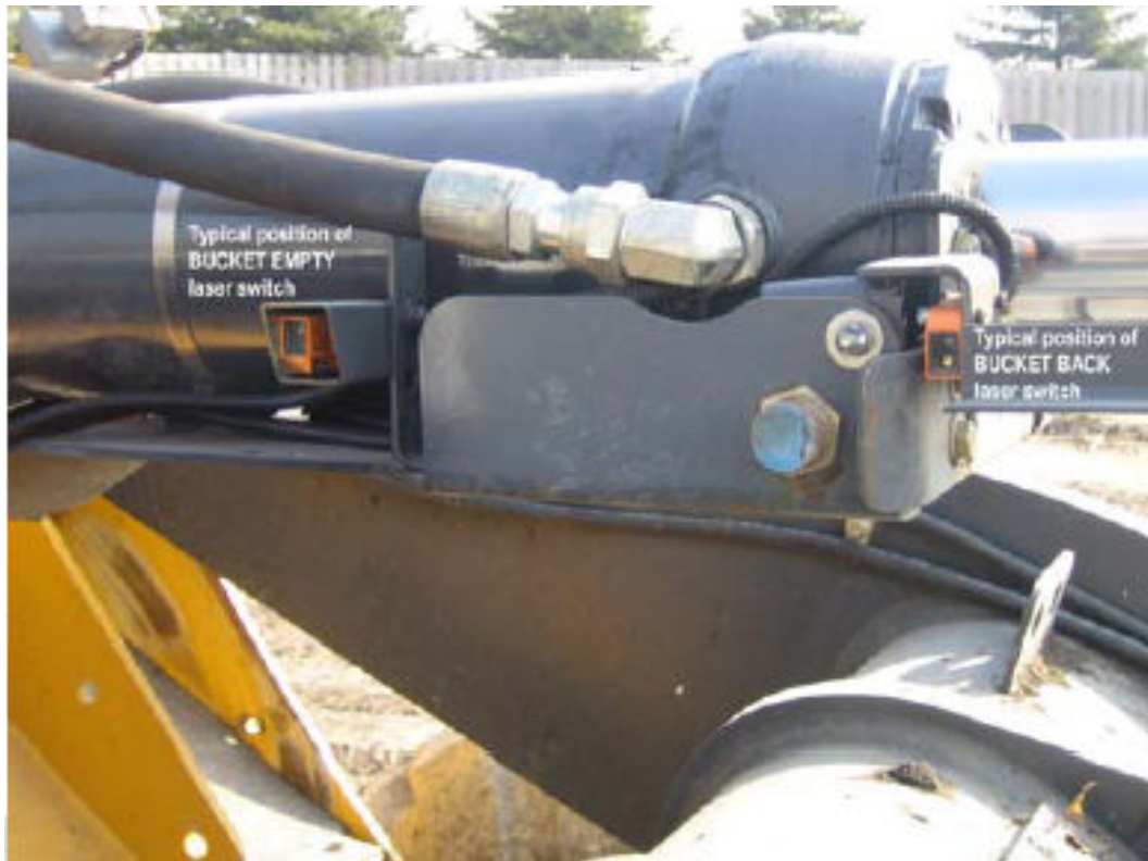
Figure 5 Typical AAA-20710 “crowded back/forward” location sensors