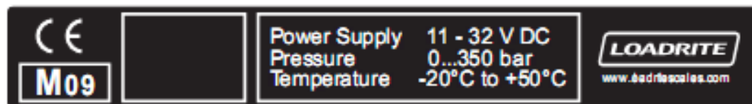
Figure 8 Side label