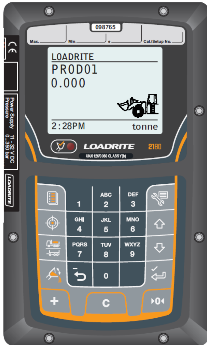
Figure 7 Loadrite L2180 indicator console